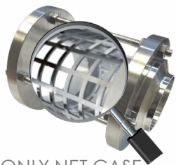
ONLY NET CASE

Custodia di ricambio in rete per il vetro spia