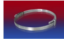
CLAMP 210 BRIDGE CLAMP